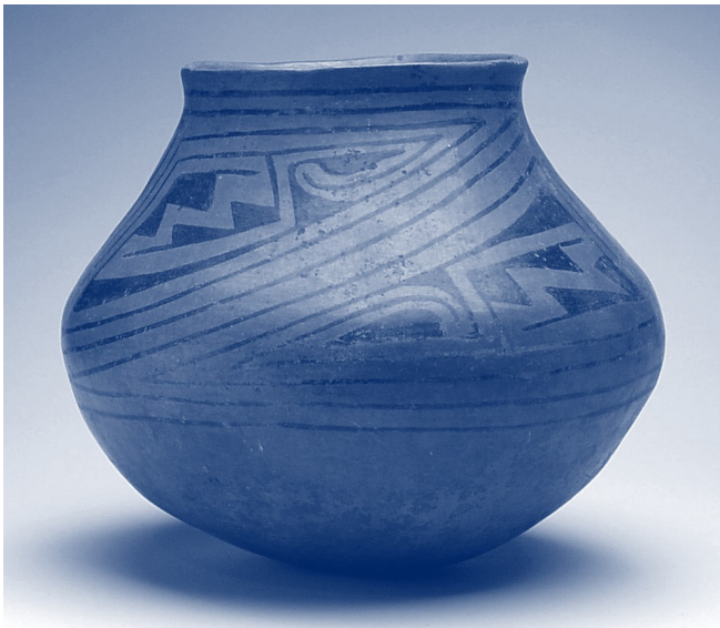
This olla, or pot with holes near the rim for hanging, was made by the people of Casas Grandes, pre-16 th century

The people of Casas Grandes created several different types of unique pottery, including effigy pots (in the shape of humans or animals), polychrome pottery (with patterns in different colors), and many other forms that had both practical and ceremonial uses. Along with those items previously mentioned, archaeological finds throughout Mexico and the American Southwest show that this pottery was traded with many different cultures and was valued for its beauty and function. Come learn more about pottery from Casas Grandes and some of the earliest artifacts from our collections in the new year.