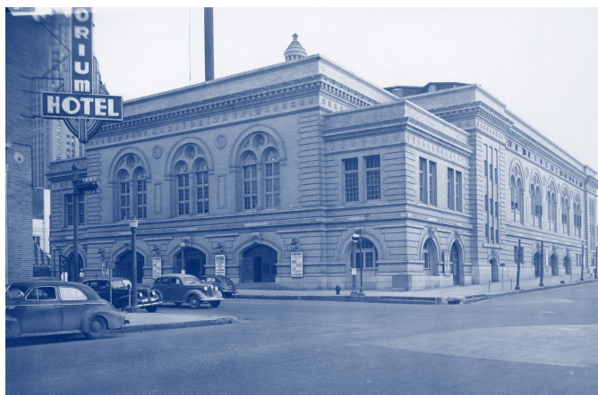
Above: Houston, Texas, City Auditorium, Sept. 1946 by Cecil Thomson; SJMH collection. Left: The Lancaster Hotel today. Courtesy The Lancaster Hotel.