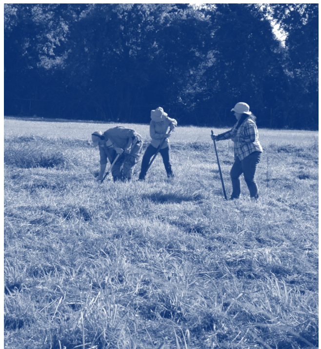
Archeologists working on the survey of the land purchased for future museum expansion.